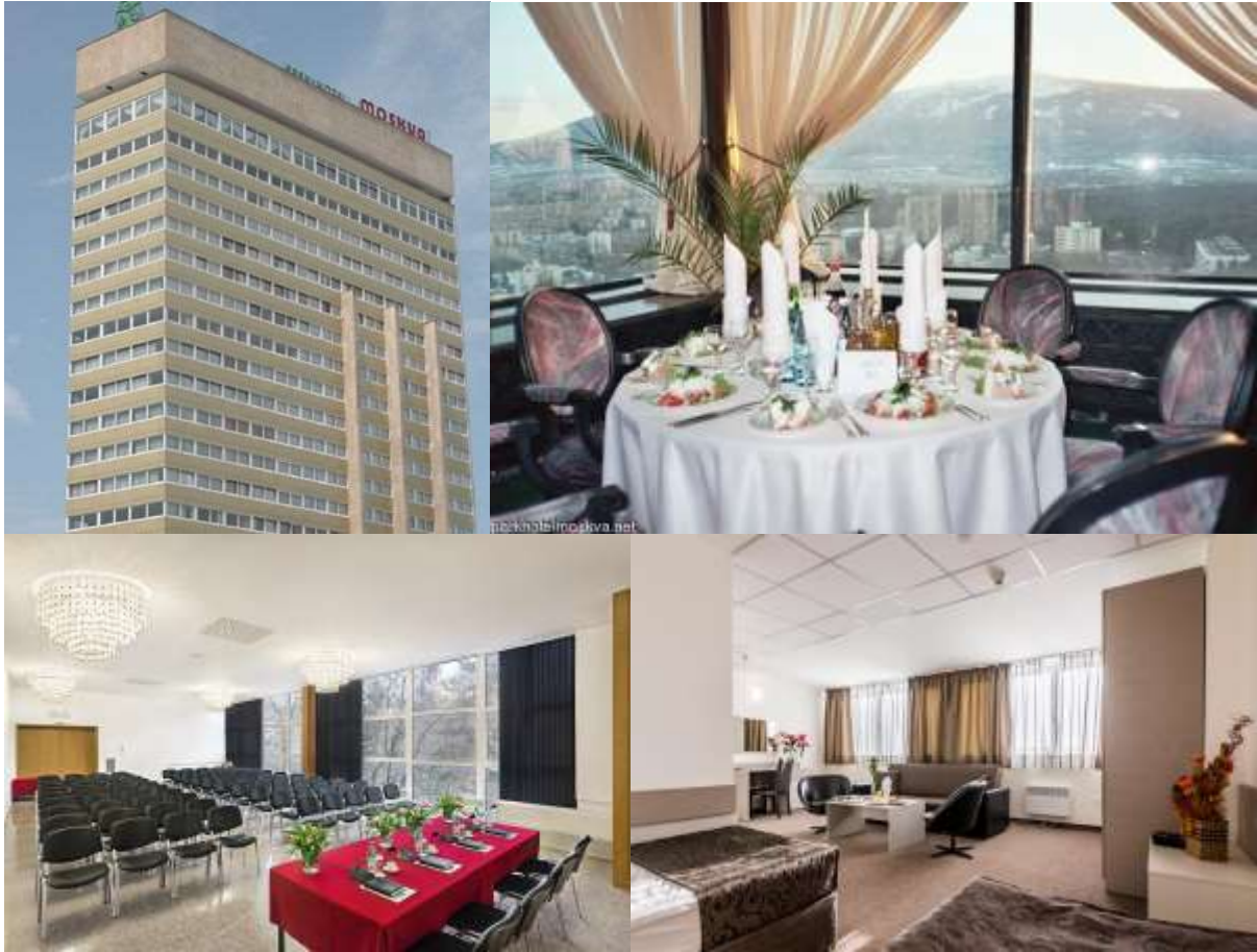
Park Hotel Moskva (Venue 2)

Website: http://www.parkhotelmoskva.net/lang-en.htm