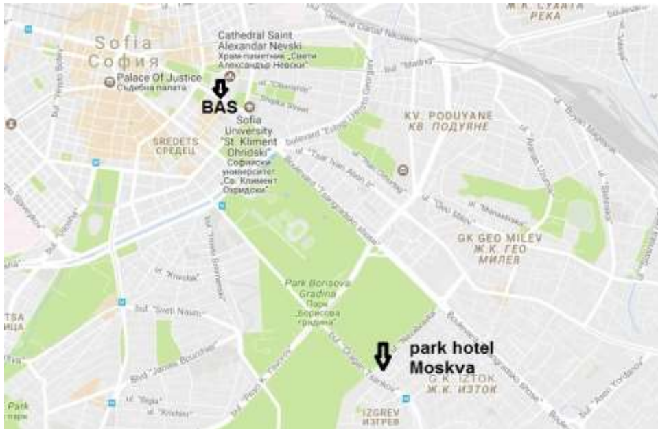
Map of Sofia with the Conference venues 1 (BAS) and 2 (Park Hotel Moskva).

Address: 25 Nezabravka Street, Sofia 1113, Bulgaria.