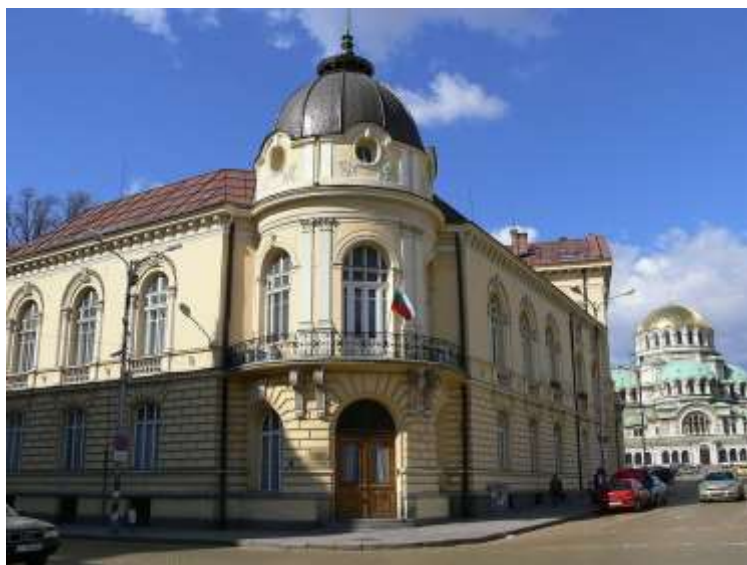
Central Administration of the Bulgarian Academy of Sciences (BAS) (Venue 1)

Website: http://bas.bg/bulgarian-academy-of-science